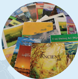
J. & B. T. Southeast Asia

"In July, distribution of printed copies of 'The Ancient Path,' a gospel booklet J. developed to overcome objections to Christianity in Southeast Asia, surpassed four million copies worldwide. 'The Ancient Path' is now available in over 75 languages, many of which are mother tongue languages of unreached people groups. Live Global national partners in Myanmar report that when they distribute this resource, Burmese people immediately stop their activities to read it."