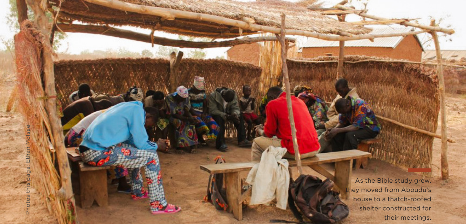
As the Bible study grew, they moved from Aboudu's house to a thatch-roofed shelter constructed for their meetings.

killed chicken on the pedestal as a sacrifice to the gods,” Ethan explained.